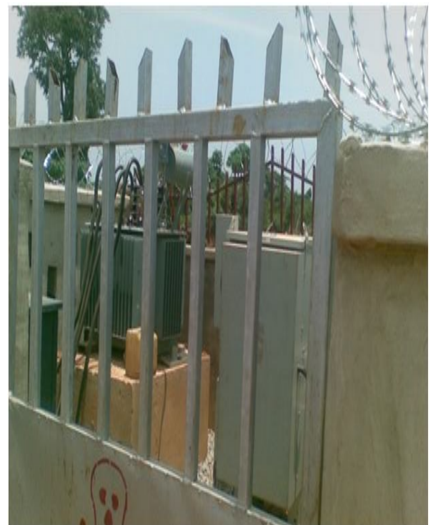
Electricity Supply to Lokogoma Housing Estate