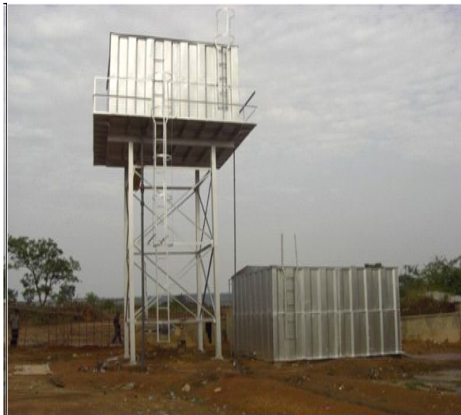
Water Supply to the Houses

The infrastructural development consist of the peri-meter fence; internal electrification which was changed from overhead to underground cabling in conformity with FCDA development standards; the internal roads & drainages; water boreholes & reticulation; central sewage & treatment plant. Works have progressed significantly and are at different stages of completion.