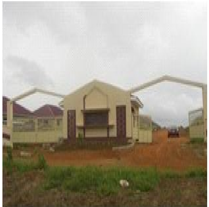
Welcome to Lokogoma Housing Estate