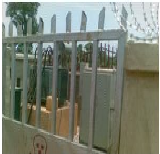
Electricity Supply to Lokogoma Estate