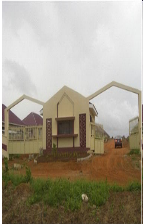
Welcome to Lokogoma Housing Estate