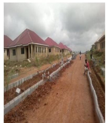
Road Work in Progress at the Lokogoma Estate

Deputy Corps Commander Secretary General FHCS